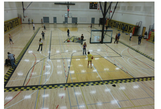
Gymnasium at Chinook High School