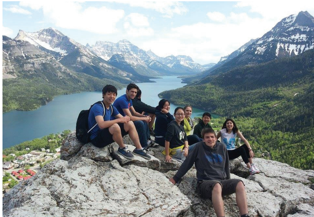
International Student Excursion to Waterton International Peace Park