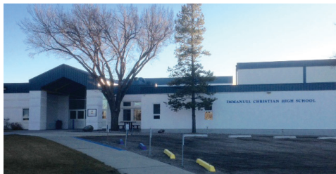
Immanuel Christian High School 802 6 Avenue North, Lethbridge, AB www.immanuelchristian.org