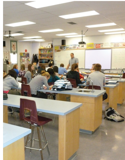
Science lab at Winston Churchill High School