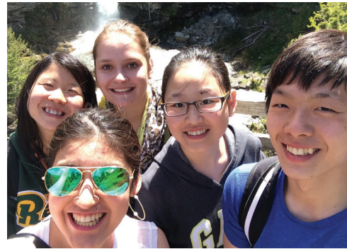
Students from three continents