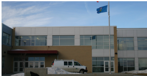
Chinook High School 259 Britannia Boulevard West, Lethbridge, AB www.chs.lethsd.ab.ca