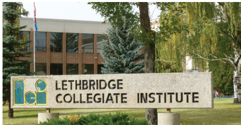
Lethbridge Collegiate Institute 1701 5 Avenue South, Lethbridge, AB www.lci.lethsd.ab.ca