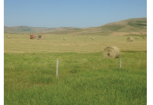
Area surrounding Lethbridge