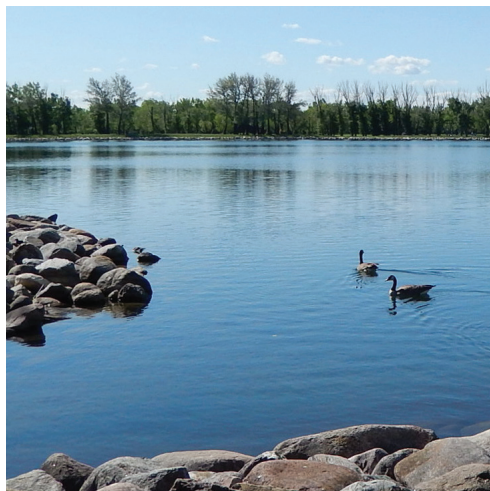
Henderson Lake in South Lethbridge