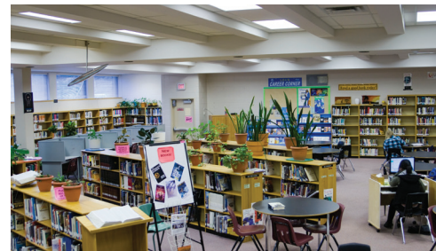
Library at Lethbridge Collegiate Institute