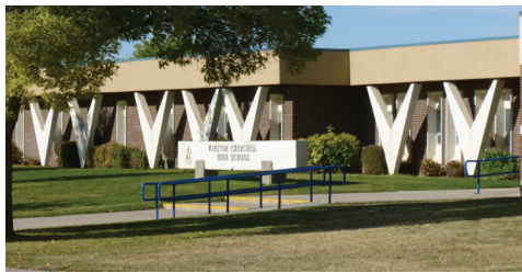
Winston Churchill High School 1605 15 Avenue North, Lethbridge, AB www.wchs.lethsd.ab.ca