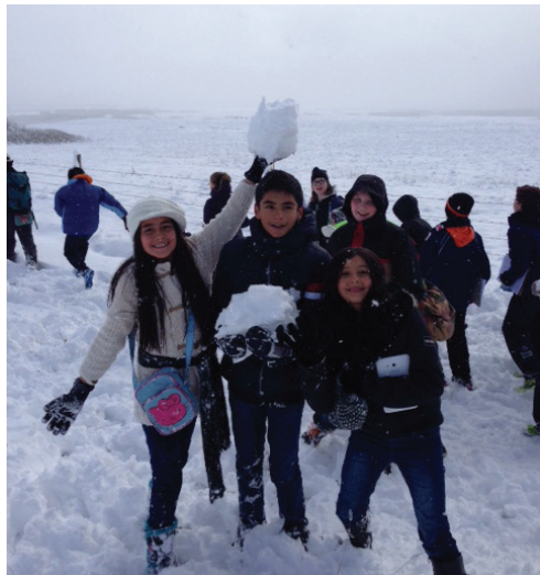
Students see snow for the first time!