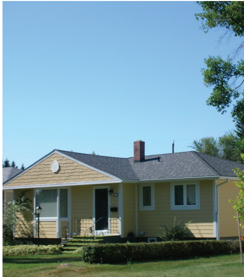
Typical home in Lethbridge, Alberta